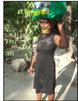
A Haitian woman carries her goods to the market place.

Schools have resumed. Students are wearing masks and we pray that it will not be necessary to interrupt their education again. The months of August, September and October will be considered the last semester of the 2019-2020 school year. The 2020-2021 year will start in November.