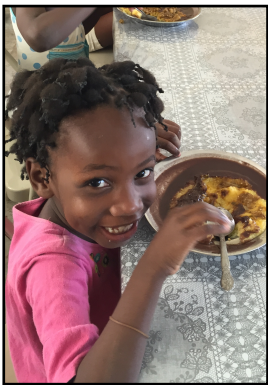
Enjoying the daily dinner

The prayer of a righteous person is powerful and effective. James 5:16