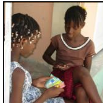
Game time (left) and snack time (below) at Summer Camp.

Your gifts will go a long way in bringing love, hope and mercy to the children in Haiti.