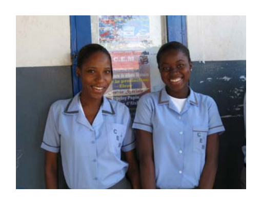
Faces of Rescue One